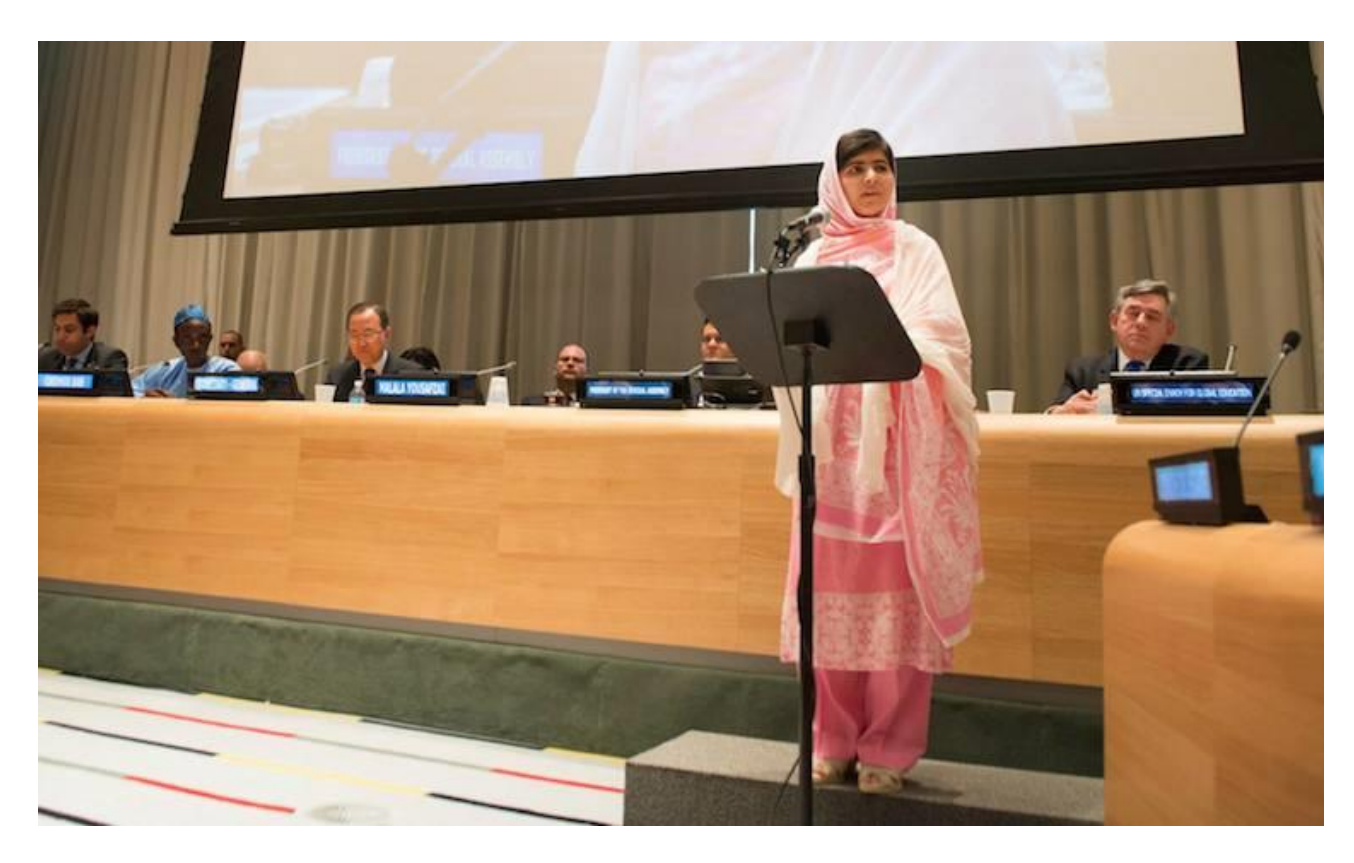
"A World at School" Malala Yousafzai's speech at the Youth Takeover of the United Nations