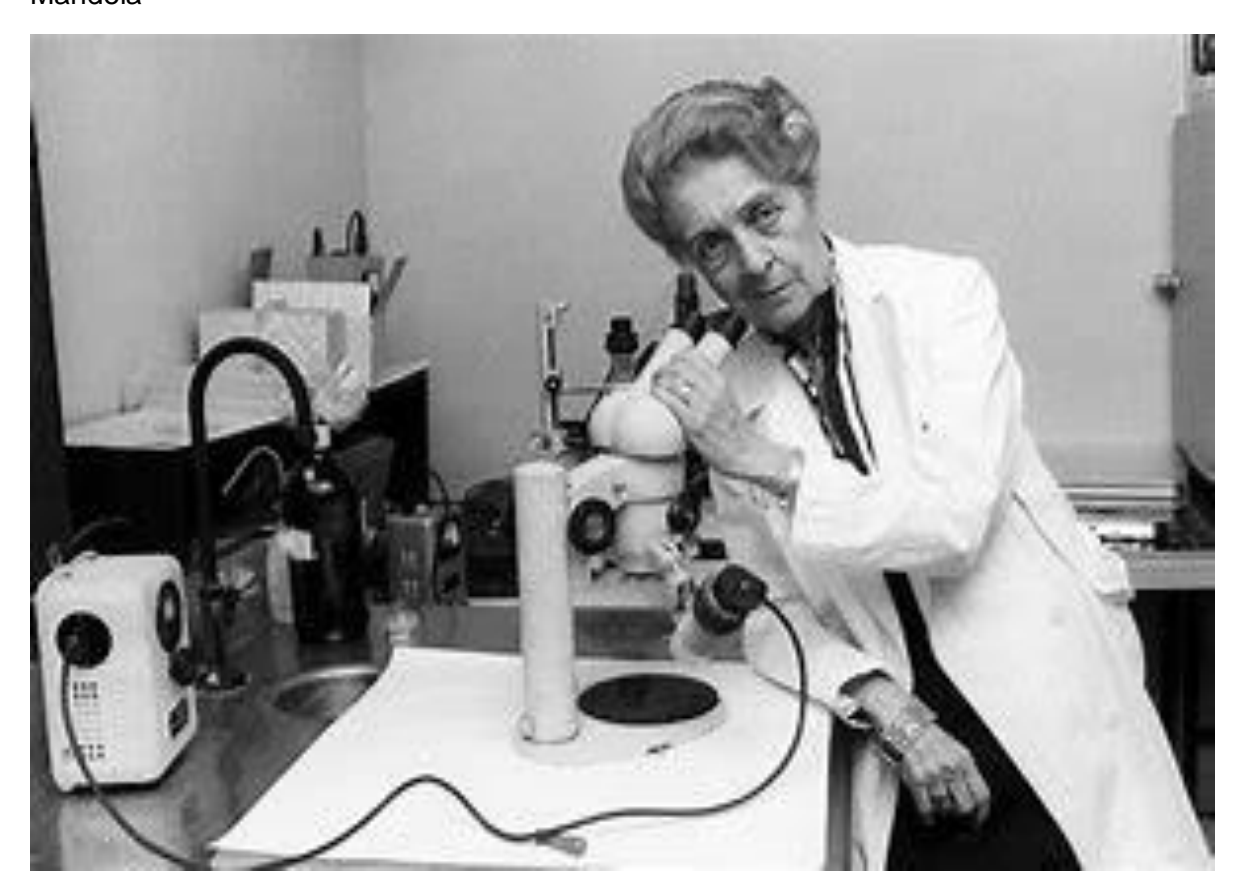
"After centuries of dormancy, young women can now look forward a future moulded by their hands"